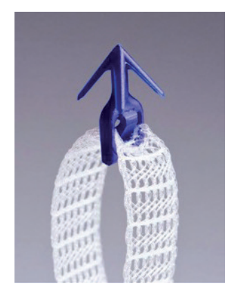
Figure 1. – TFS nchorA 4 pronged polypropylene anchor approximately 11x4mm with a one-way trapdoor at its base sits on a stainless steel applicator. A 7m mm

Create transverse incision (4cm) at versical/cervical junction. Hydrodissect to separate vaginal mucosa from bladder, identify CL; dissect bladder from vaginal mucosa, plicate cystocoele if necessary (2-0 PDS); apply TFS anchor at insertion of CL to ATFP sited approximately 2cms superior and 1cm lateral to the ischial spine. Close tunnel and incision in layers.