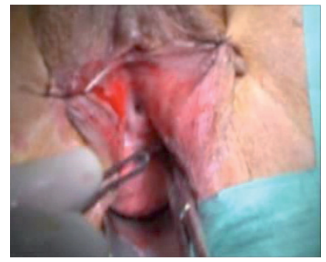
Video 2. - Link for the video: www.pelviperineology.org

plained of lower abdominal pain (relieved on lying down), frequency and urgency. This patient had anterior vaginal repair 6 years ago, because of 2nd degree cystocele and severe urgency. After the procedure, her symptom of urgency improved, but the symptoms recurred two years ago.