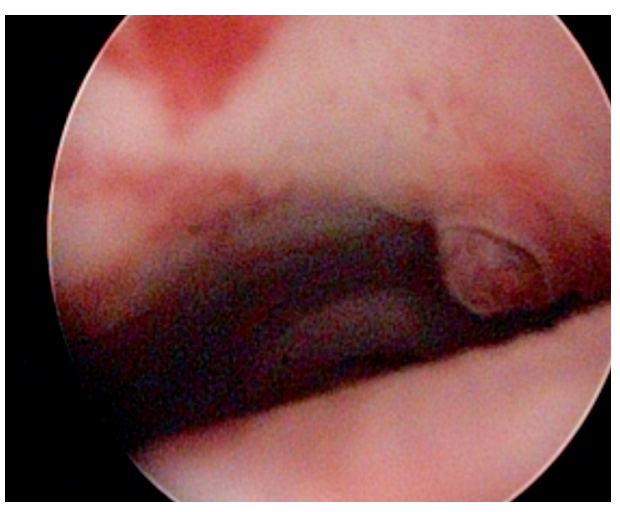
Figure 1. – Vaginoscopy revealed a 3 - 4 mm ulcer on the left side of anterior vaginal wall caused by vaginal leech (the ulcer is seen on the right side of the photo). The anterior lip of the cervix is seen (above the ulcer) at the centre of the top of vagina.

An 8-year-old pre-pubertal female underwent air evacuation from a remote Northern Territory community to Royal Darwin Hospital (RDH) for heavy vaginal bleeding. History revealed that she had been swimming in a local billabong and a number of had removed a leech from her vaginal introitus after experiencing a non-painful sensation. Following this event child experienced continuous bright vaginal bleeding of moderate amount. This was noticed by her aunt who sought review at the community primary