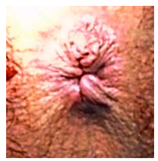
Fig. 3 – Haemorrhoids post-operative. There was minimal pain, and the patient was discharged on the second post-operative day.

and postoperative evacuating proctograms, Abenstein et al.<sup>4</sup> demonstrated cure of anterior rectal wall intussusception with a posterior sling, but did not report cure of hemorrhoids..